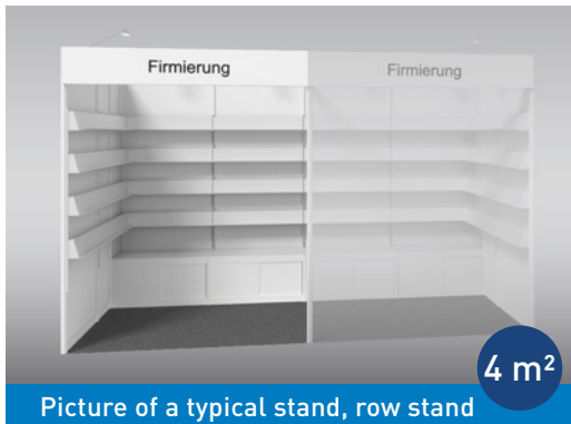
Picture of a typical stand, row stand