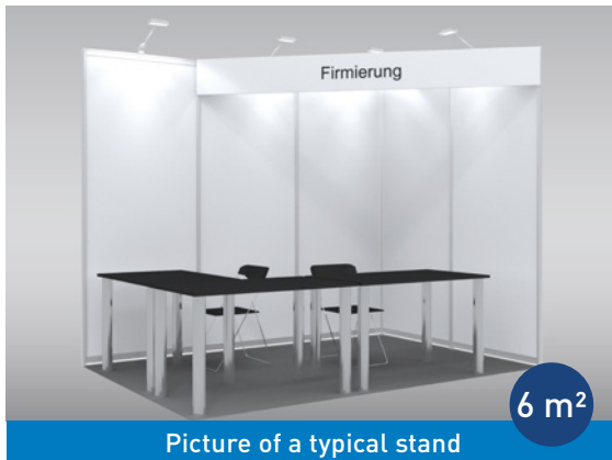
Picture of a typical stand