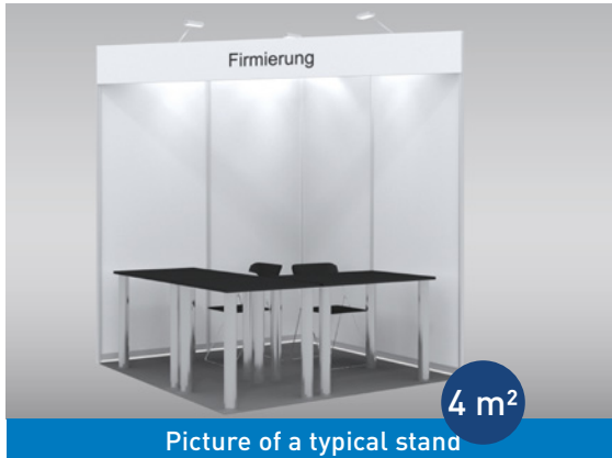
Picture of a typical stand